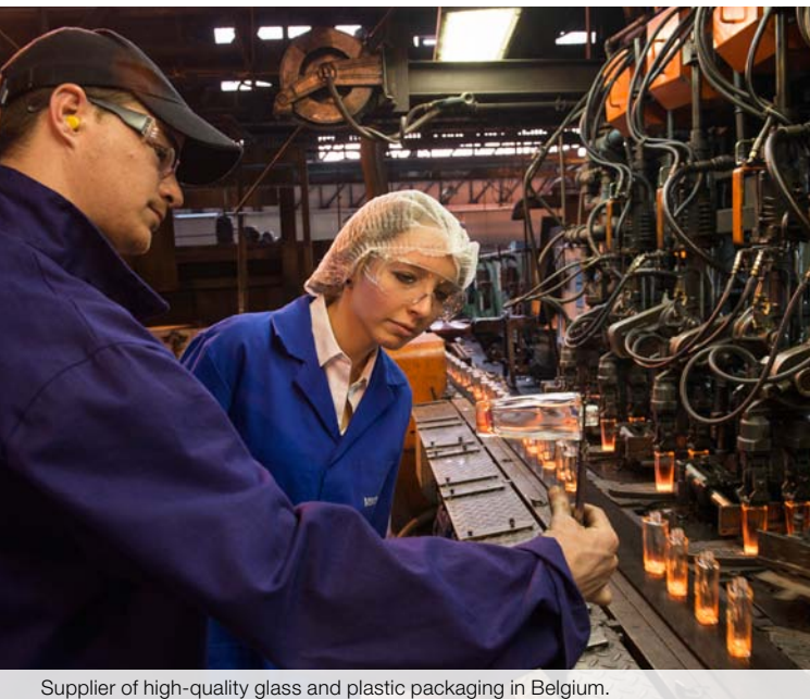
Supplier of high-quality glass and plastic packaging in Belgium.

■ For L'Oréal, it is fundamentally important that each woman, wherever she lives in the world, should have the possibility of taking maternity leave that is sufficiently long and fully paid.