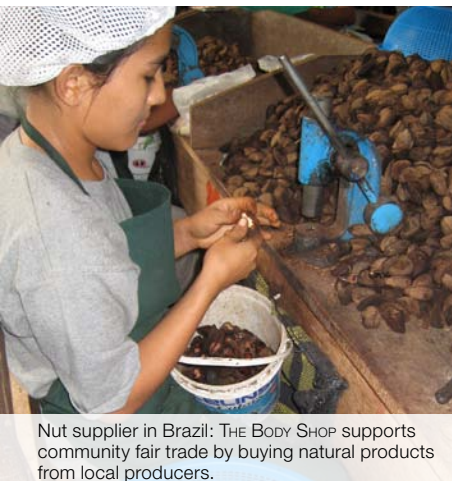
Nut supplier in Brazil: THE BODY SHOP supports community fair trade by buying natural products from local producers.

“ We want to share our prosperity through the involvement of economically vulnerable people. That means, in practice, providing long-term access to work and to an income for more than 100,000 people from communities in social or financial difficulty. ” J.-P. Agon