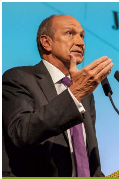
Jean-Paul AGON Chairman and CEO of L'Oréal

■ On October 23 rd , 2013, L'Oréal announced its new sustainability commitment for 2020 "Sharing beauty with all" that I would like to share with you.