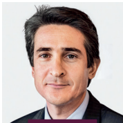
Mr Patrice Caine