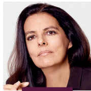
Ms Françoise Bettencourt Meyers