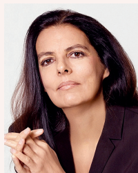
Françoise Bettencourt Meyers